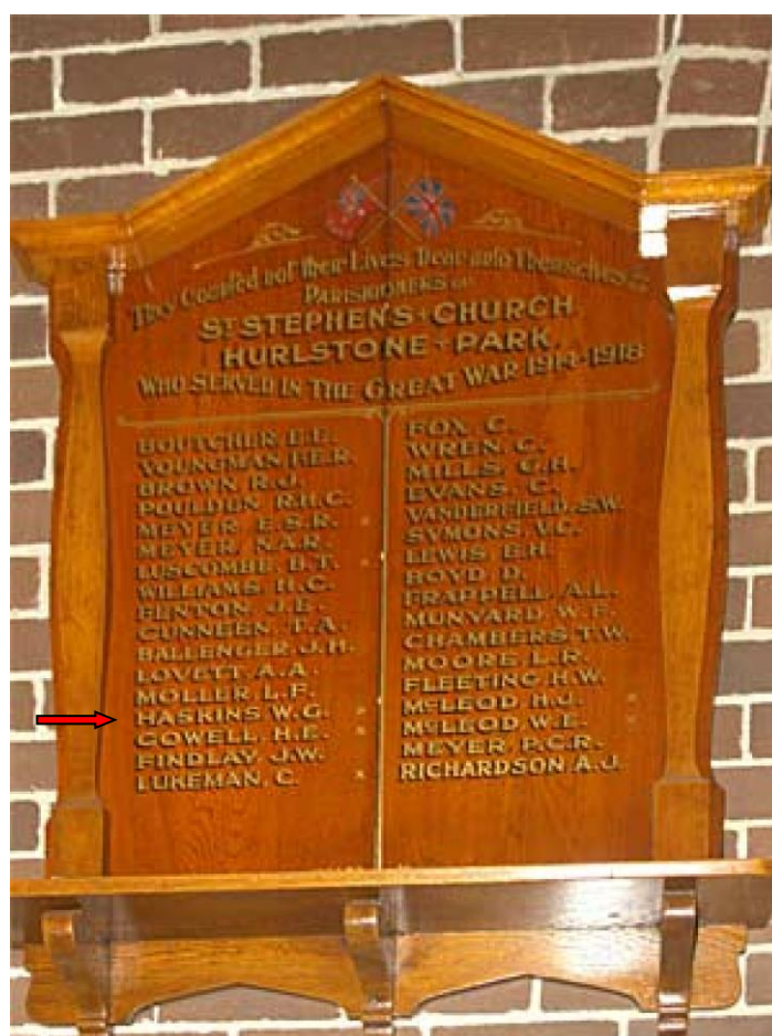
St Stephen's Church, Hurlstone Park Great War Roll of Honour